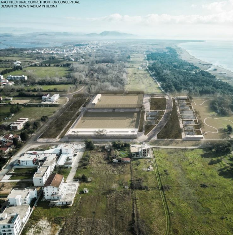
ARCHITECTURAL COMPETITION FOR CONCEPTUAL DESIGN OF NEW STADIUM IN ULÇINJ